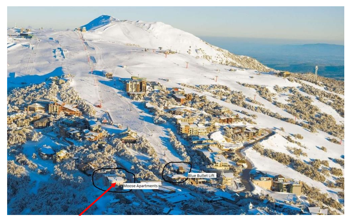
Oldina Flat 1 is on the ground floor of the Moose apartment complex

Oldina owns Flat 1 in the Moose Apartment complex located at Site 14, The Avenue. This is an outstanding location, minutes from the main Little Bourke Street ski run, effectively providing ski-in and ski-out access. It is opposite the new YHA building and very close to the village square.