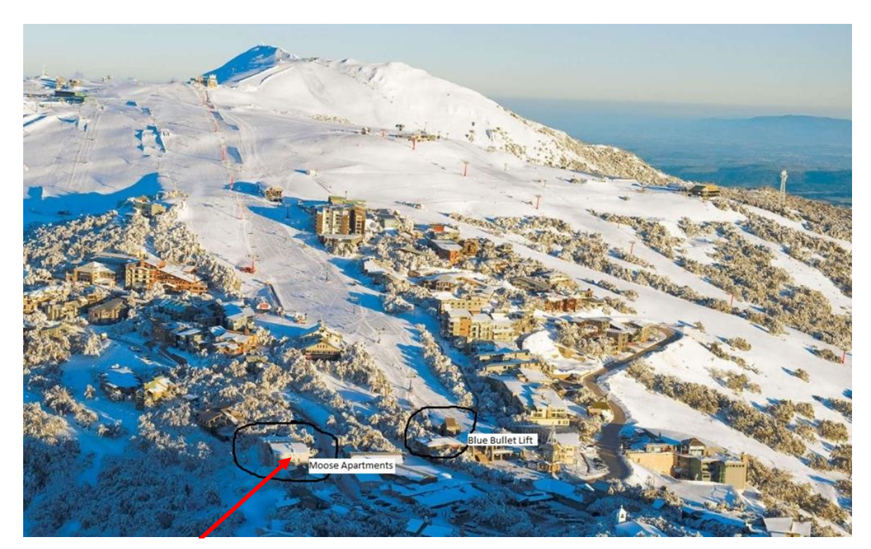
Oldina Flat 1 is on the ground floor of the Moose apartment complex

Oldina owns Flat 1 in the Moose Apartment complex located at Site 14, The Avenue. This is an outstanding location, minutes from the main Little Bourke Street ski run, effectively providing ski-in and ski-out access. It is opposite the new YHA building and very close to the village square.